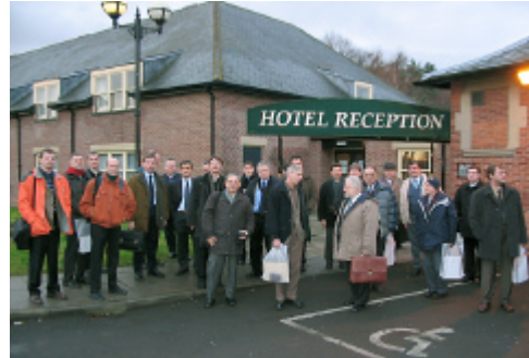
The delegates arrive in sunny York!

The forum is the first attempt to found a network of EMC laboratories on a European scale, allowing both the Department of Electronics and York EMC Services Ltd the opportunity to showcase their EMC expertise to EU candidate states looking to learn from their experience.